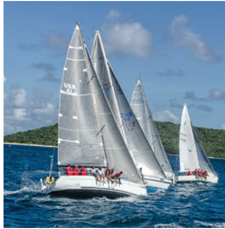
NOV 10. 25th St. Croix International Regatta. St. Croix Yacht Club.

Galleries and shops show the works of artists and jewelry makers. Art Walk is a favorite event of visitors and locals. Facebook.